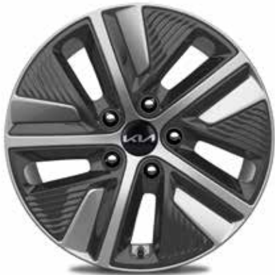
16" WHEELS (Available on HEV LX & LX Plus models, and all PHEV models)