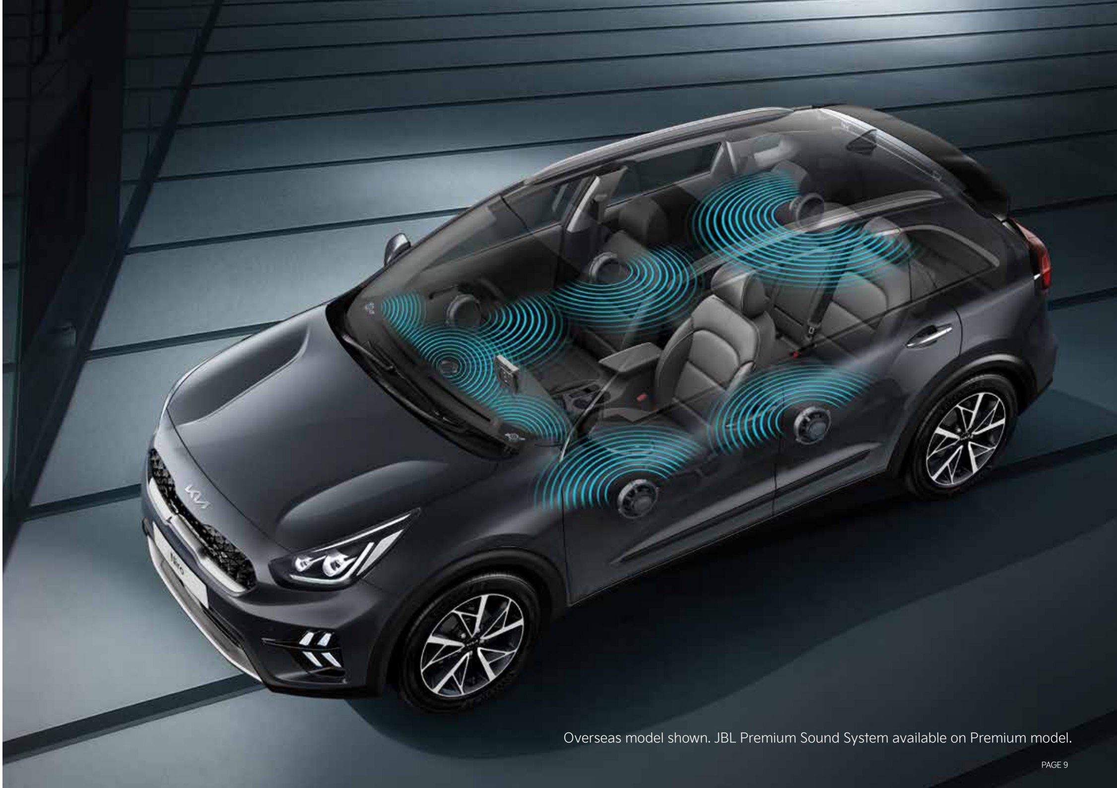
Overseas model shown. JBL Premium Sound System available on Premium model.

In Premium models the front seats are heated and ventilated. These even cool down automatically if the temperature reaches an unsafe level. Drivers get a power memory seat, while privacy glass features in the rear.