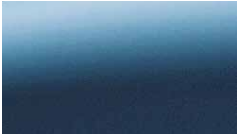
Deep Cerulean Blue