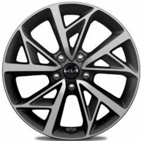
18" WHEELS (Available on HEV Deluxe & Premium models only)