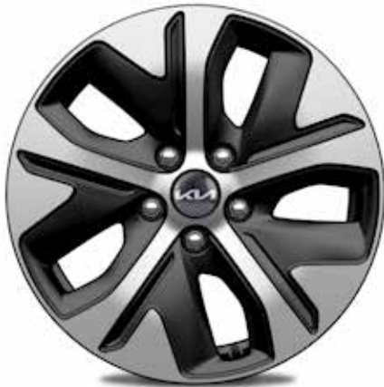
17" WHEELS (Available on EV models only)