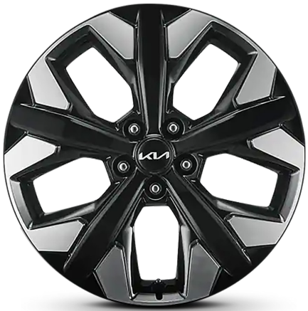
19" ALLOY WHEEL (X-Line)