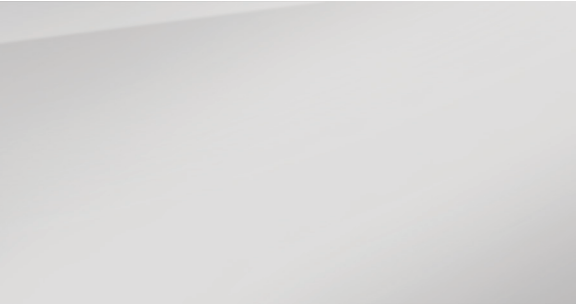
Clear White (LX & LX Plus only)