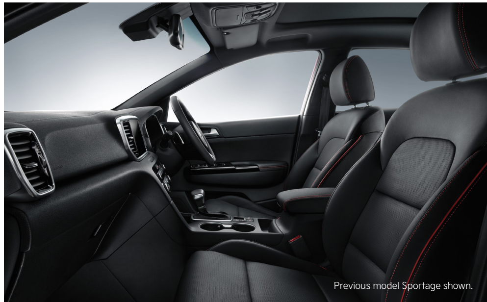
Previous model Sportage shown.