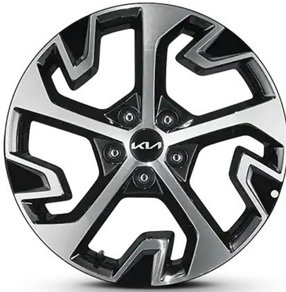
18" ALLOY WHEEL (LX Plus)