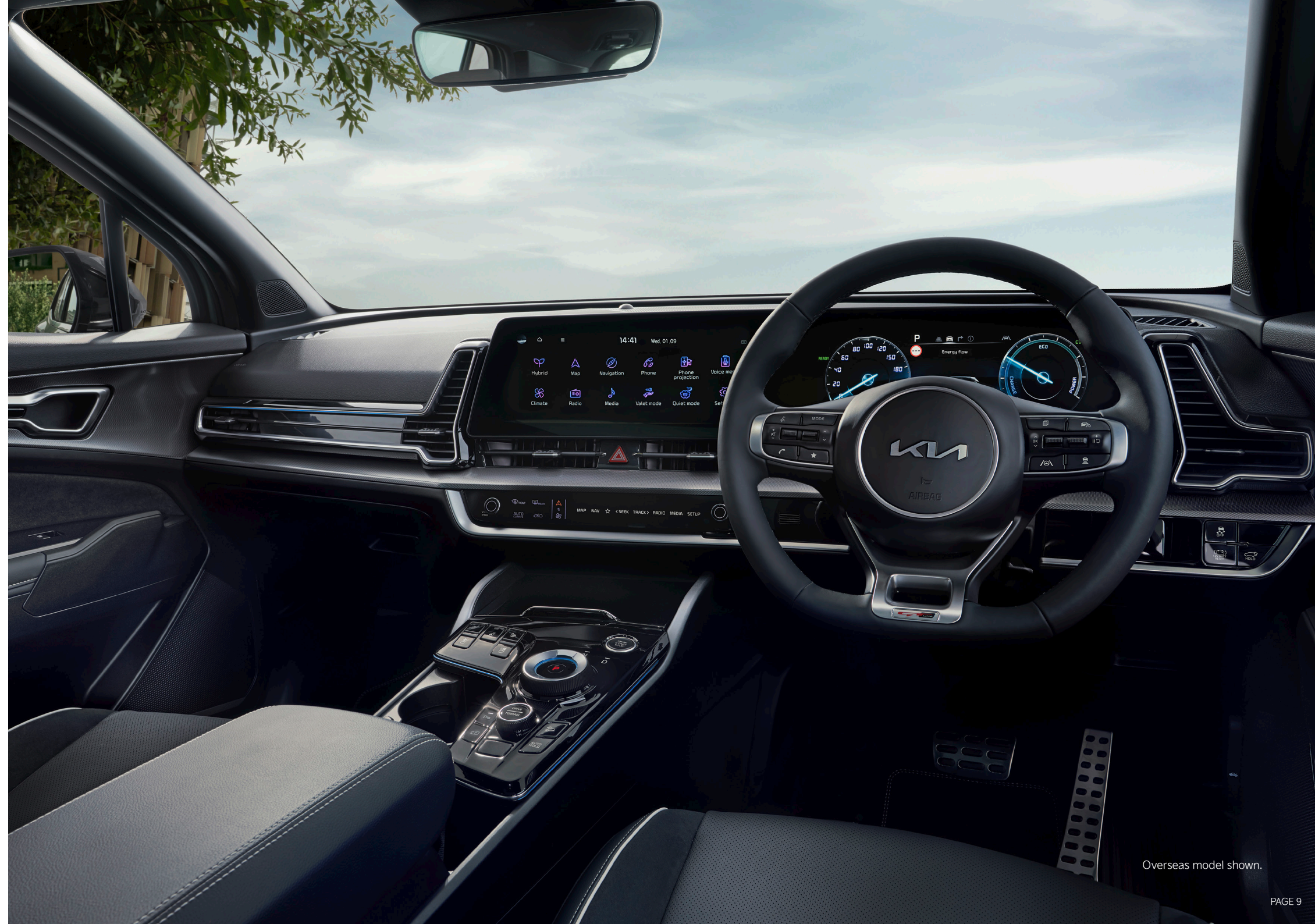
Overseas model shown.

Not all features are available on all models.