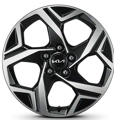
17" ALLOY (LX)