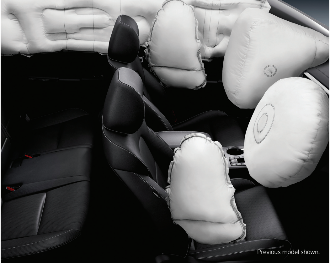
Previous model shown.