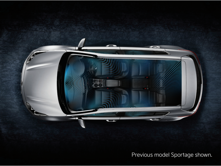
Previous model Sportage shown.