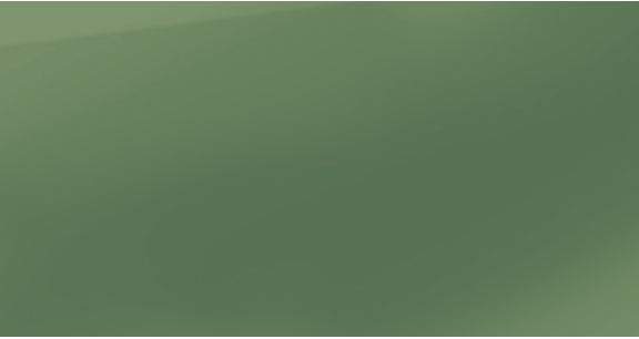
Jungle Wood Green (X-Line only)