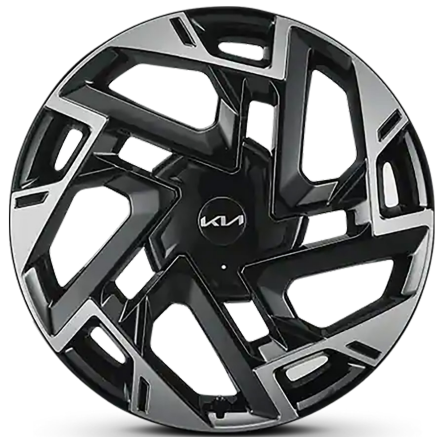
19" ALLOY WHEEL (DELUXE)