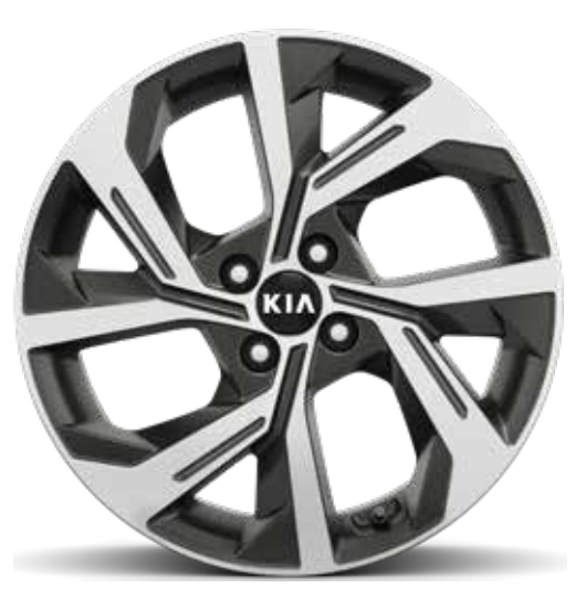
17" ALLOY (LX-T, GT Line & GT Line Plus)