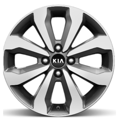
16" ALLOY (EX)