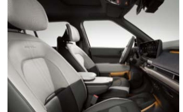
Light & Earth Trims