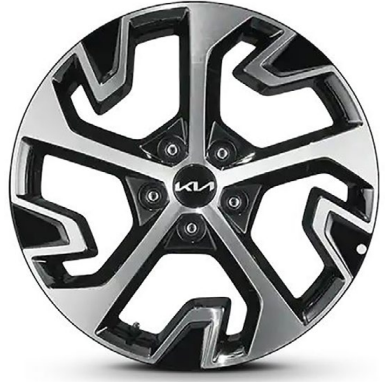
18" Alloy (Light HEV & LX Plus)