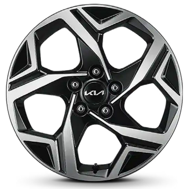
17″ Alloy (LX)