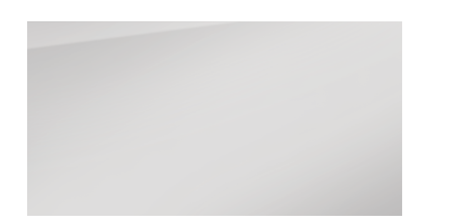
Clear White (LX, LX Plus & Light HEV only)