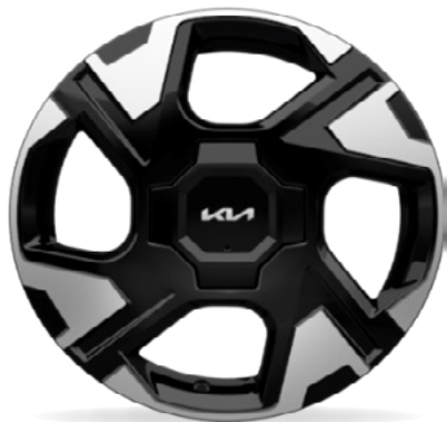
16" Alloy (LX)