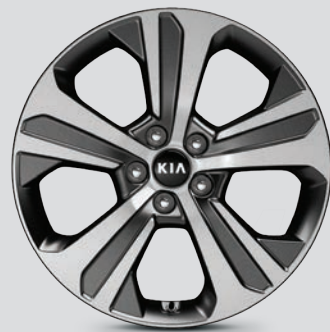
19" Alloy wheel (LTD & Premium)