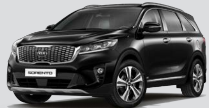
Aurora Black Pearl