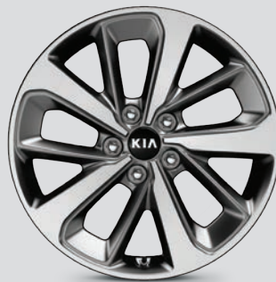
18" Alloy wheel (EX)