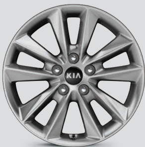
17" Alloy wheel (LX)