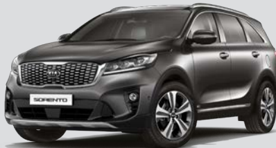
Steel Gray (LX)