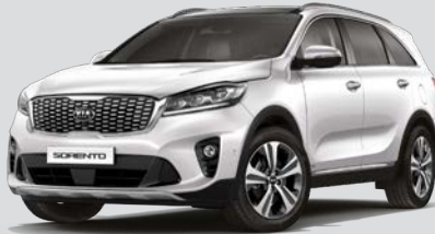
Snow White Pearl (LTD & Premium)