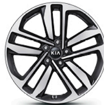
19" Alloy wheel (EX)