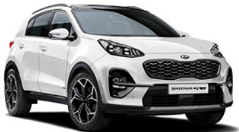
Snow White Pearl (GT Line)