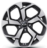
17" Alloy wheel (LX)