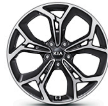
GT Line 19" Alloy wheel (GT Line)