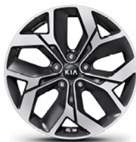
18" Alloy wheel (LX Plus)