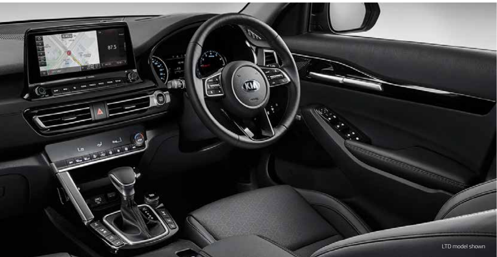
LTD model shown