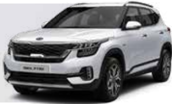
Snow White Pearl