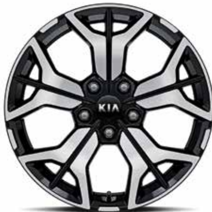
17" Alloy EX