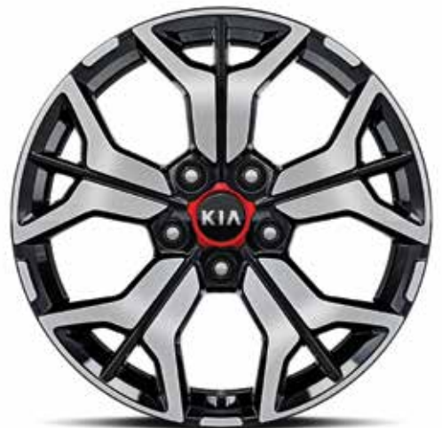
18" Alloy LTD

Two-tone colours are available at additional cost.