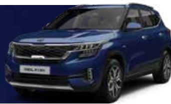
Dark Ocean Blue