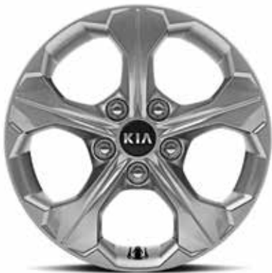
16" Alloy LX and LX PLUS