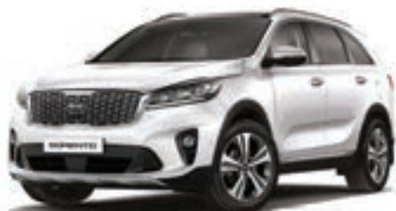
Clear White (SX)