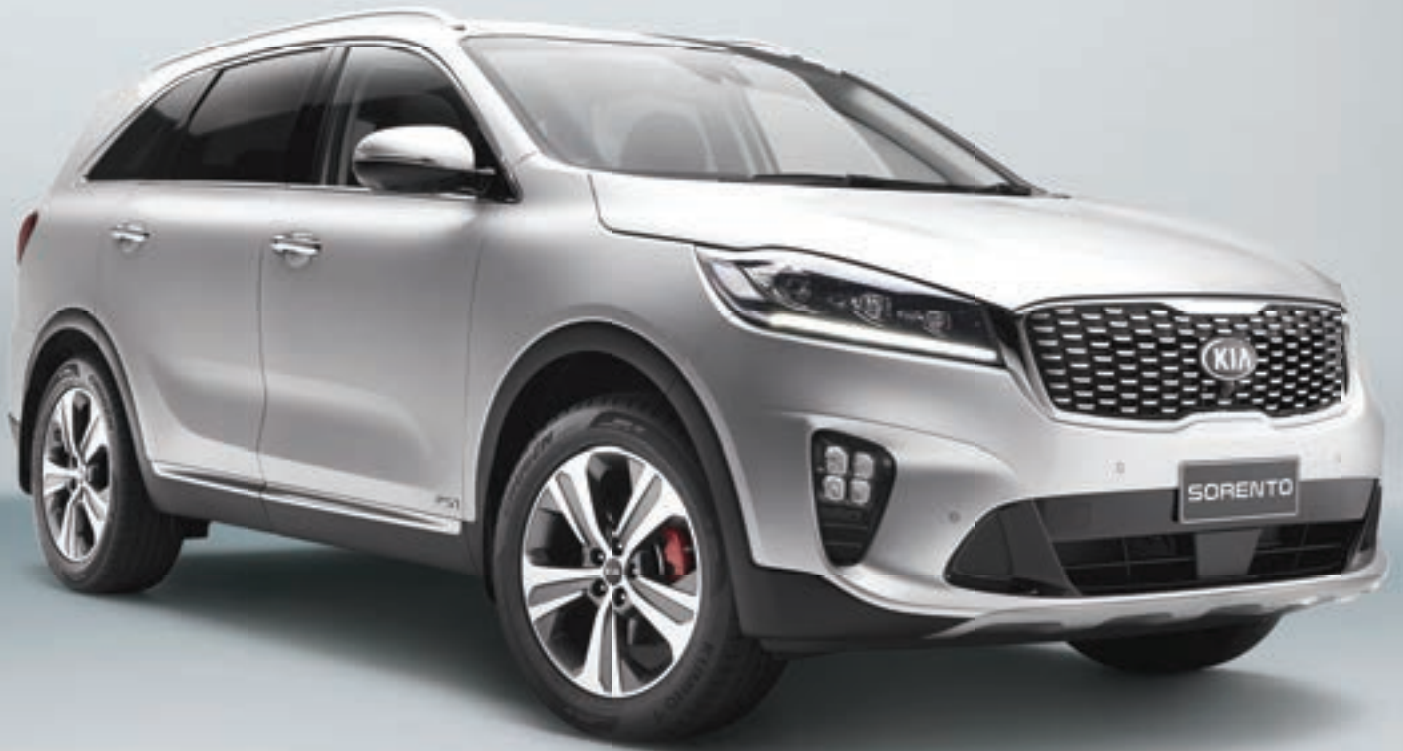
Sorento GT-Line Premium shown.