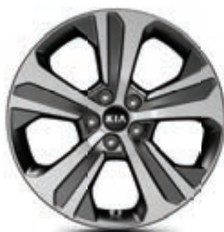
19" Alloy wheel