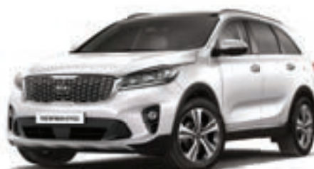
Snow White Pearl (GT Line & GT Line Premium)