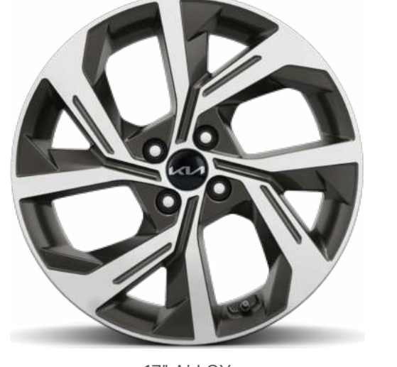
17" ALLOY (LX-T, GT Line & GT Line Plus)