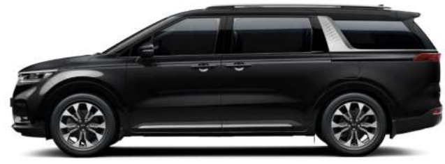
Aurora Black Pearl