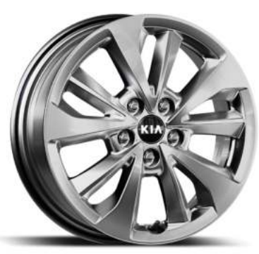
17" Alloy (EX)