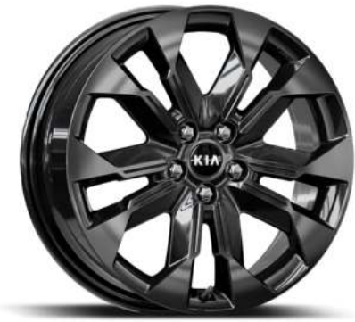
19" Alloy (Deluxe and Premium)