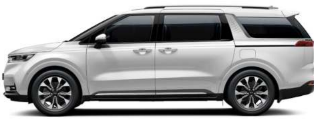
Snow White Pearl