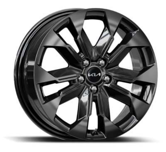
17" ALLOY (EX)