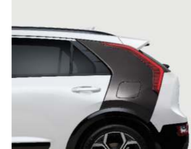
Dark Grey C-Pillar