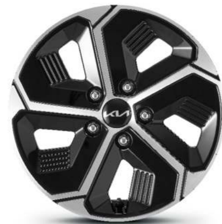
16" Alloy (Light & Earth models)