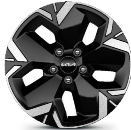
17" Alloy (EV models)