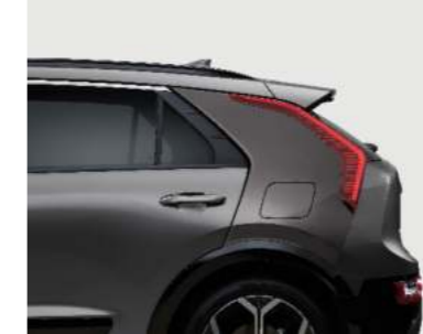
Dark Grey C-Pillar