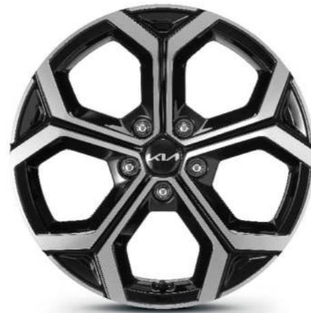
18" Alloy (Water & GT-Line models)