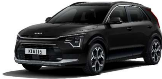
Aurora Black Not available PHEV Light