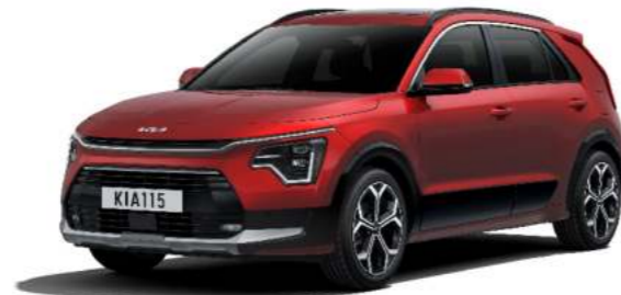
Runway Red Not available PHEV Light