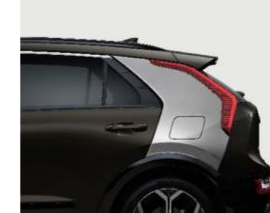
Light Grey C-Pillar