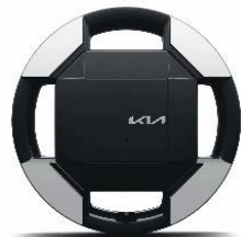
16-inch Alloy Wheel^ (full-size wheel cover applied) ^Passenger Van Wheel Only