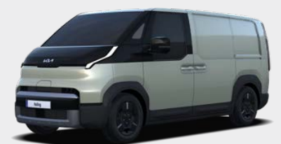
Soft Mint Gloss