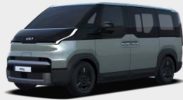
Lakehouse Grey Gloss