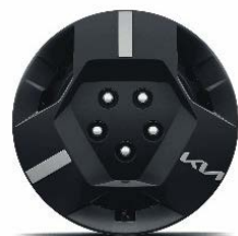
16-inch Steel Wheels* (full-size wheel cover applied) *Cargo Van Wheel Only