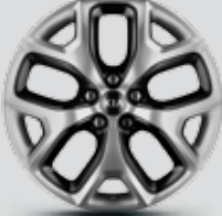
19" Alloy wheel Two-tone finish