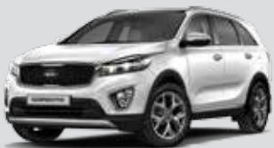
Snow White Pearl