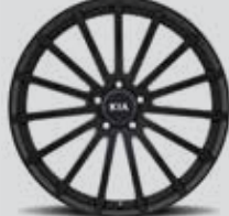
20" Alloy wheel Satin Black finish