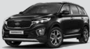
Aurora Black Pearl