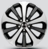
18" Alloy wheel Black machine finish