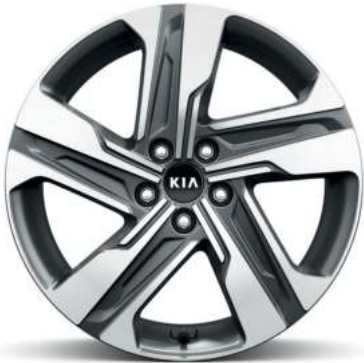
19" ALLOY Hybrid 2WD Premium Hybrid AWD Premium Plug-in Hybrid AWD Premium Deluxe Diesel