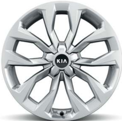
20" ALLOY Premium Diesel