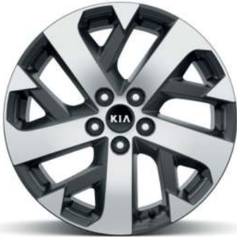
18" ALLOY EX Diesel