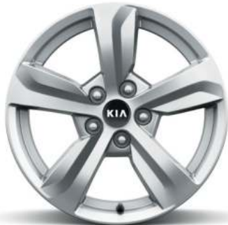
17" ALLOY LX Diesel