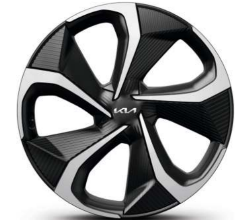
20" ALLOY (GT-Line model)