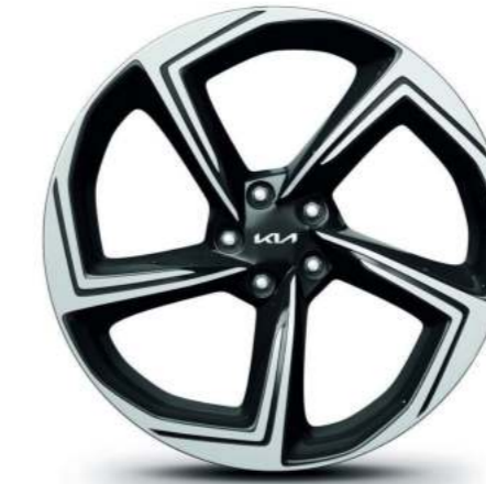
21" ALLOY (GT Model)

Colour swatches are indicative only, vehicle body colours may appear different in person.