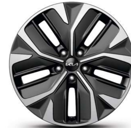
19" ALLOY (Air & Earth models)