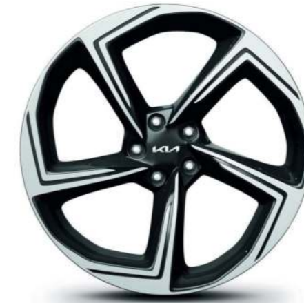
21" Alloy (GT Model)