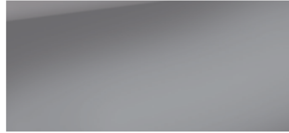
Moonscape Matte (Premium paint charge applies - $1,450 incl. GST)

A eye-catching shade for those who love the classic sportscar look. Bold and extraverted in a way that's never overstated or brash.