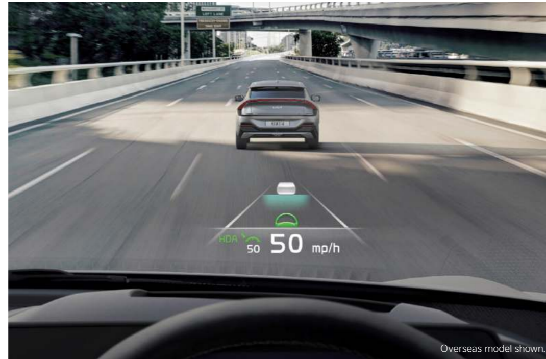
Overseas model shown.

On the open road, Smart Cruise Control* uses radar sensors and a camera to maintain a safe distance from the vehicle directly ahead while a trio of anti collision systems scans for pedestrians and oncoming vehicles at intersections. And because there isn't always a visible road sign, the EV6's Intelligent Speed Limit Assist system uses a front view camera and navigation data to keep you informed of the current speed limit.