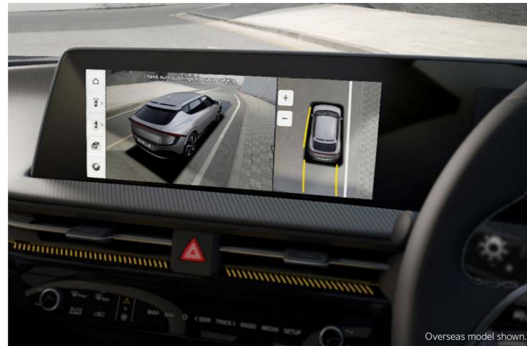
Overseas model shown.