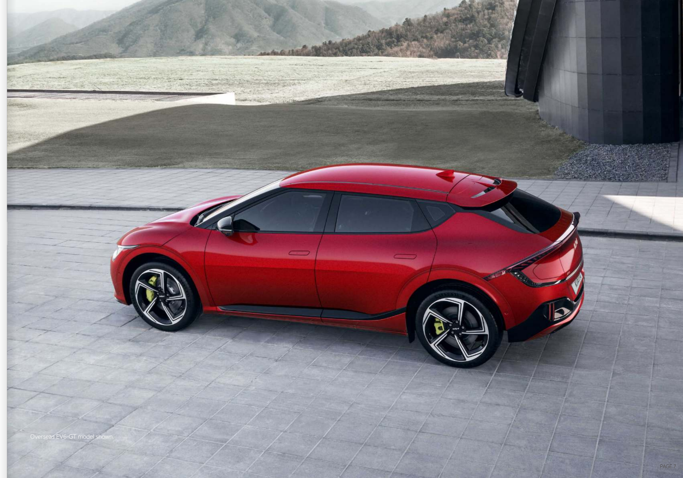
Overseas EV6-GT model shown.