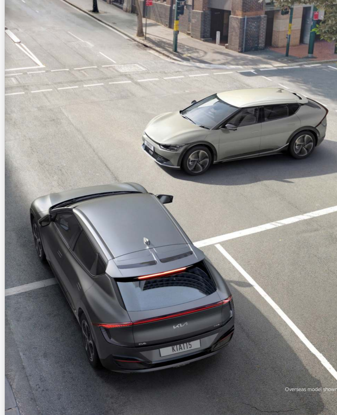
Overseas model shown.