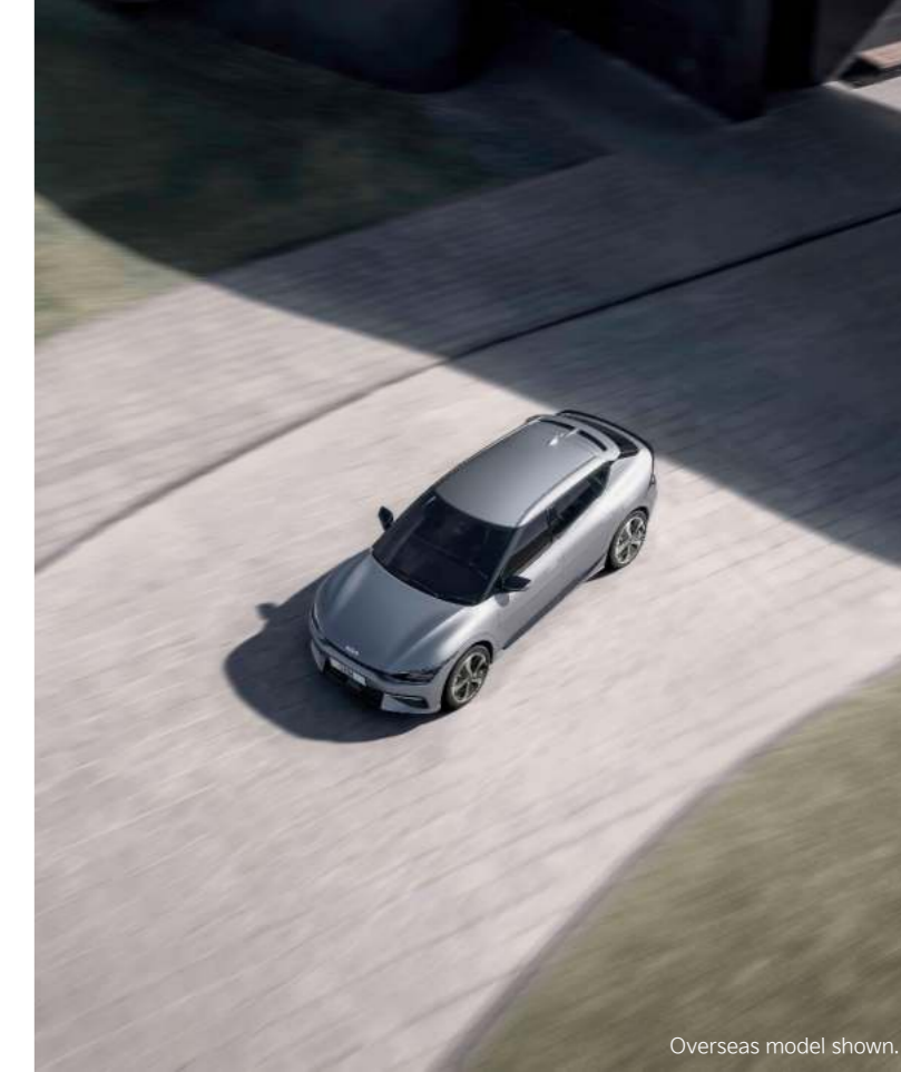
Overseas model shown.

Activate the turn signal and the wide-angle, side mirror mounted cameras act as a second pair of eyes, displaying live footage of your blind spots on the dash cluster display screen. Should you attempt to change lanes while an object is in the blind spot, the Blind Spot Collision Avoidance system warns you with audio-visual alerts and haptic steering feedback. Even if you were to miss these warnings, the Electronic Stability Control will ultimately take over to prevent a collision.