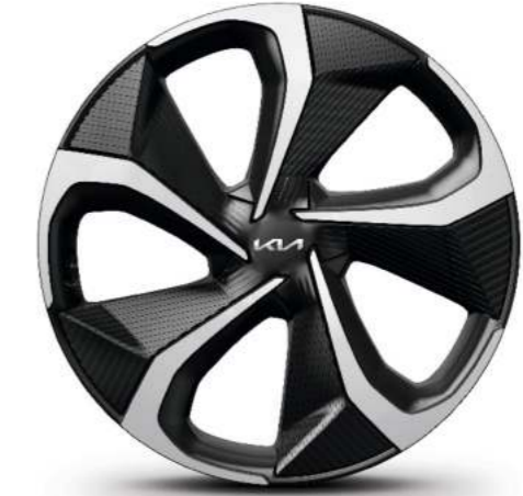
20" Alloy (GT-Line model)