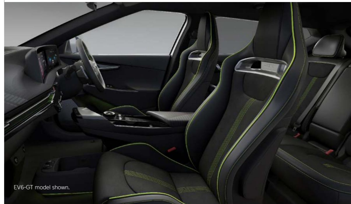
EV6-GT model shown.